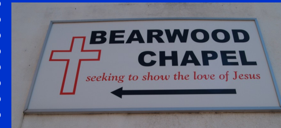
"What's in a Motto"