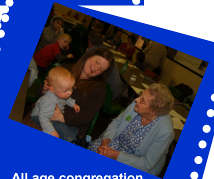
All age congregation